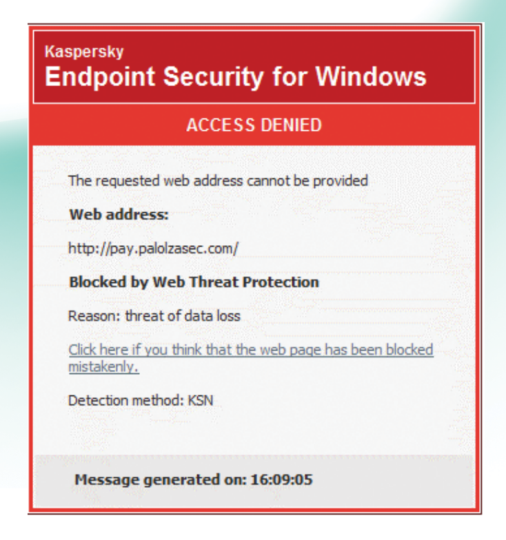
Fig. 2 – Dangerous site alert

When an object's accumulated statistics confirm that it's malicious, secure or has an unknown status, that information is made available across all supported Kaspersky Lab products where users have enabled Kaspersky Security Network – without any human intervention. Similarly, when malicious web resources are processed, users automatically receive a warning of the danger when they try to access it.