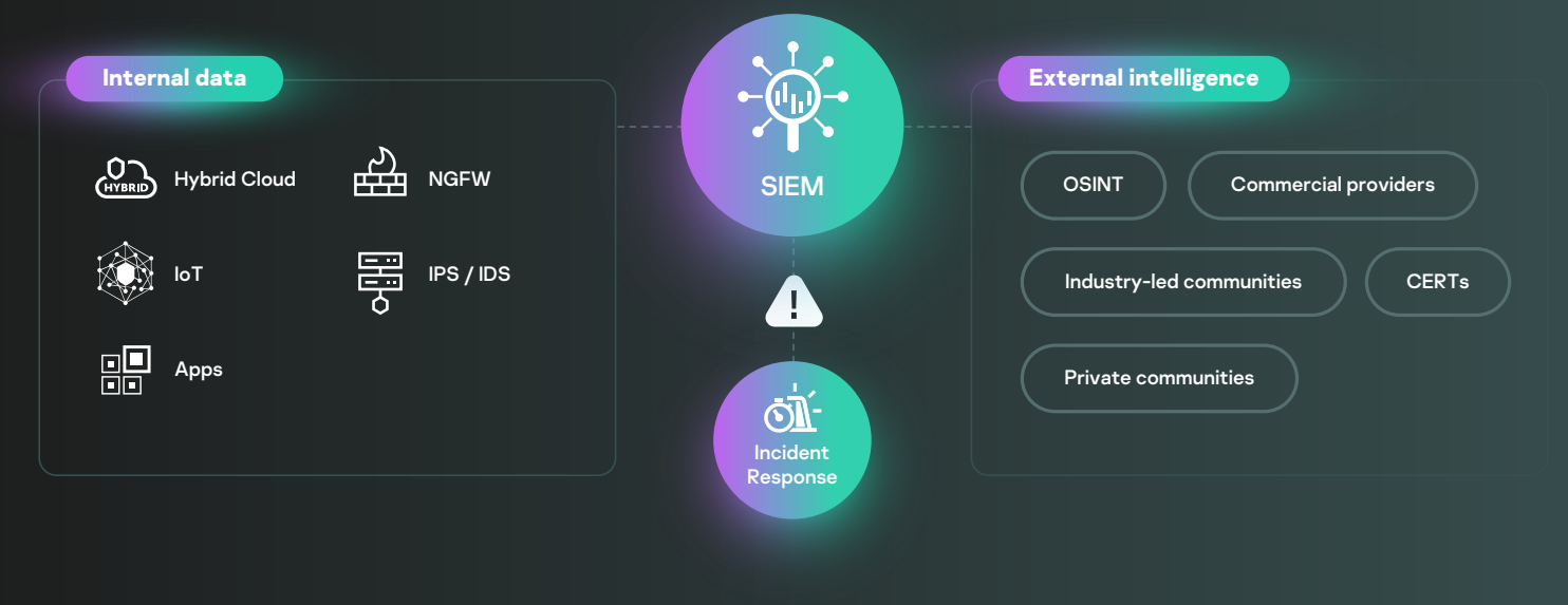
Figure 2 Operationalizing External Threat Intelligence

Data from intrusion detection and prevention systems, firewalls, application logs and logs from other security controls can reveal a lot about what's going on inside a company's network. It can identify patterns of malicious activity specific to the organization. It can differentiate between a normal user and network behavior and help to maintain a trail of data-access activity.